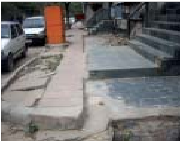
Just too many levels