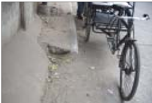
High plinth against narrow pavement