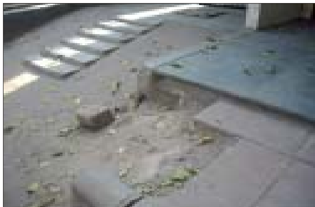
Untidy negotiation between pavement, plinth and incline