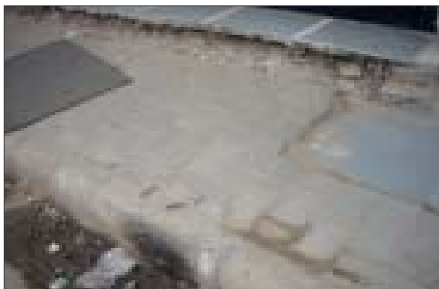
Pavement vs Plinth